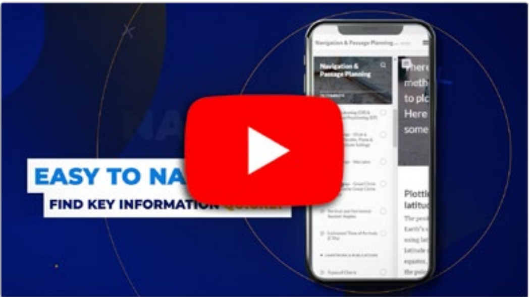
Click to watch video

This course helps develop an in-depth understanding of chartwork, tides and currents, chart & publication maintenance, watchkeeping best practices, passage planning and more.