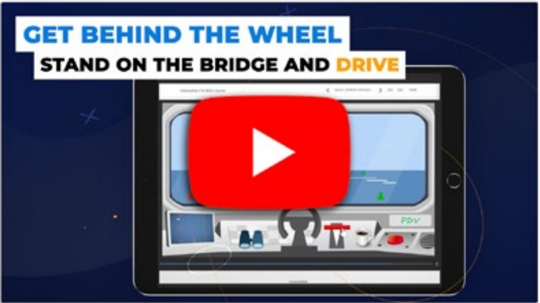
Click to watch video

The course also closely examines lights and shapes, highlighting tricks to help you remember the basics and laying out the awkward exemptions.