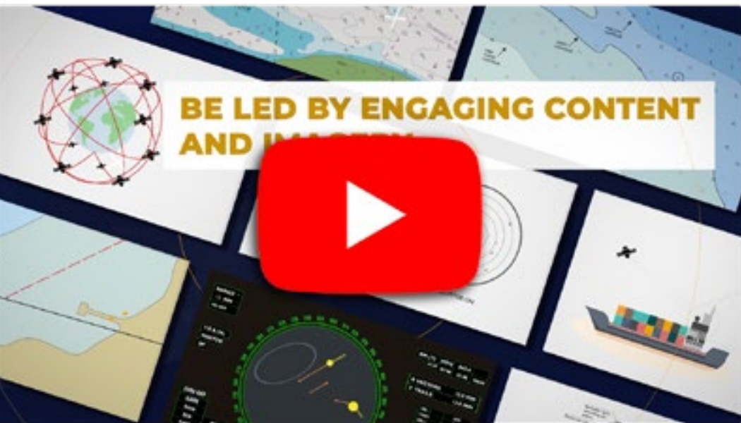
Click to watch video

The course provides a detailed overview of the vessel's electronic navigation equipment, refreshing your knowledge of the principles, setup and operation.